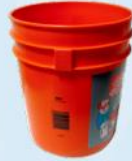
buckets (no handles)