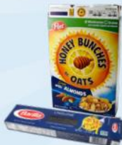
boxes and bags (flattened, nothing refrigerated)