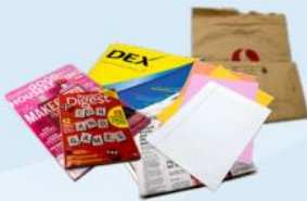
mixed paper and empty paper bags