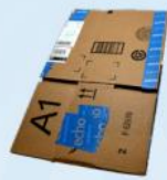
corrugated cardboard (flattened)