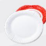
paper and plastic plates