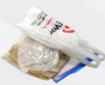
plastic bags and wrap