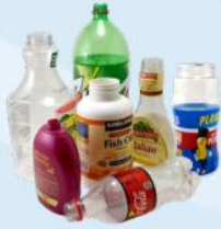
bottles (non-prescription ok)