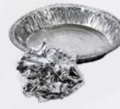
aluminum foil, pans, and plates