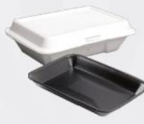
foam trays and containers