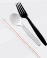
utensils and straws