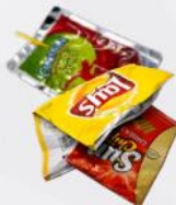
pouches and chip bags