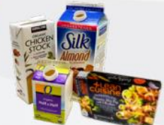
all cartons and refrigerated food boxes