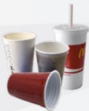
paper and plastic cups