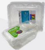
clear food containers

Still not sure? Look it up! WhereDoITakeMy.org